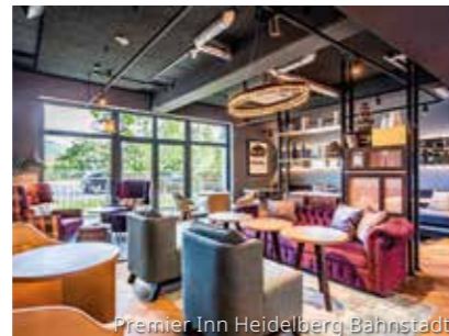
Premier Inn Heidelberg Bahnstadt

Kurfürsten-Anlage 23, 69115 Heidelberg Phone +49 6221 6484899 E-Mail: Heidelberg.City@premierinn.com www.premierinn.de