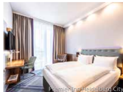
Premier Inn Heidelberg City